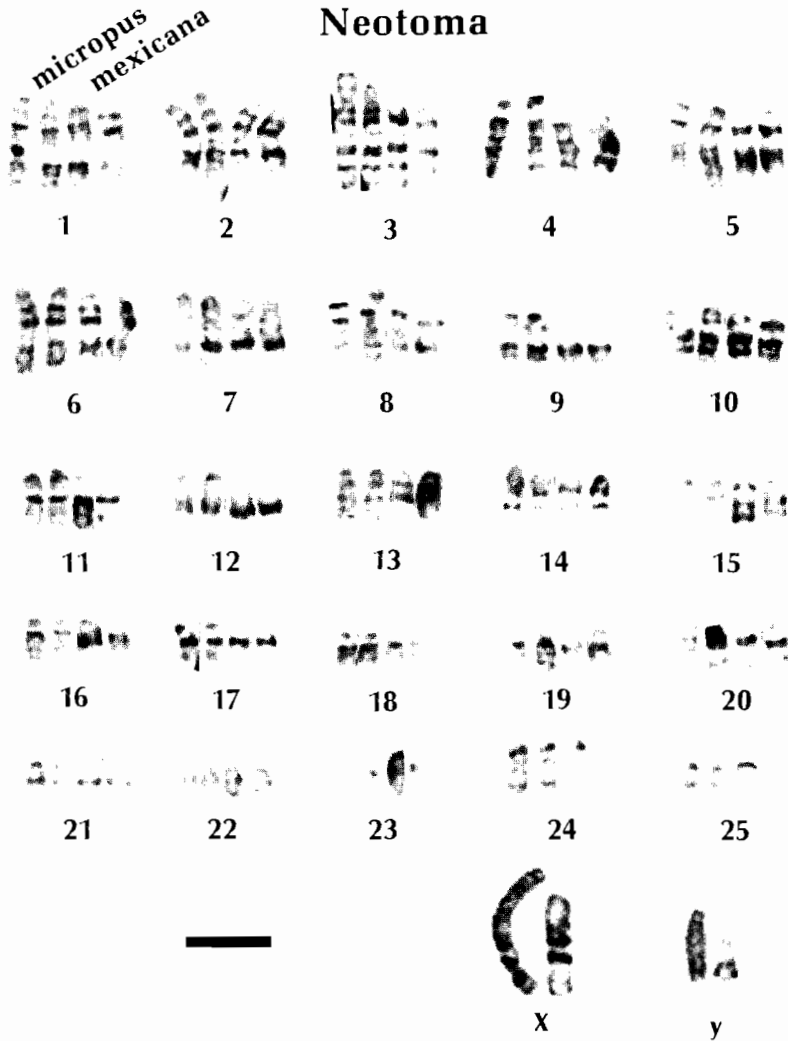
FIG. 1.—A comparison of diploid G-banded chromosomes of Neotoma micropus and N. mexicana . Chromosomes are numbered according to the standard chromosomal numbering system for Peromyscus (Committee for standardization of chromosomes of Peromyscus , 1977).

that euchromatin distal to the centromere in the long arm appears to be missing in N. mexicana . In chromosome 23 the biarm condition in N. micropus seems to be rearranged to the acrocentric condition in N. mexicana ; however, because of the presence of so few bands in 23, we are unsure of proposed homology. Because the standard