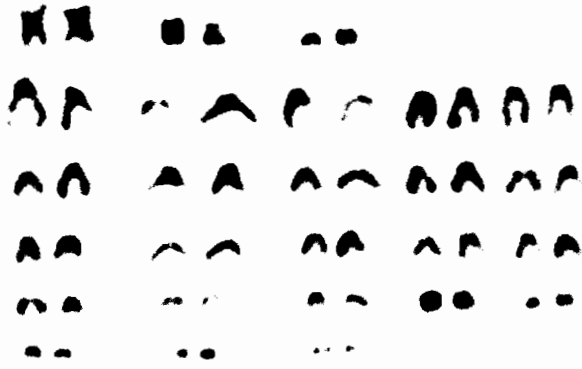
Fig. 3. Representative karyotype of the female holotype of Rhogeessa hussoni from Suriname (CM 63934). The first pair of banded chromosomes are assumed to be the X-chromosomes. This figure is reprinted from Honeycutt et al., 1980.

Overall size is large compared to the other two South American species of the genus, R. minutilla and R. io , except that the length of the mandibular tooththrow is proportionally and actually shorter than in these two species. The external measurements of the holotype exceed the range of variation in a series of nine R. minutilla and 10 R. io [under the name tumida ] (Ruedas and Bickham, 1992) in four of the eight measurements studied including (range for R. minutilla followed by R. io ) metacarpal of digit 3 (25.7-28.0; 26.2-28.4), second phalanx of digit 3 (8.7-10.2; 8.8-10.0), metacarpal digit 4 (25.1-27.6; 25.9-27.4), and metacarpal of digit 5 (26.0-27.9; 26.3-27.8). The cranial measurements of the holotype exceed the range of variation of these same series in five of the 11 measurements studied including condylobasal length (8.7-9.8; 8.5-9.1), greatest length of skull (11.8-12.9; 11.7-12.6), postpalatal length (4.1-4.4; 4.0-4.4), width across upper canines (3.3-3.7; 3.4-3.6), and width across upper molars (5.0-5.5; 5.0-5.4). On the other hand, the length of the mandibular tooththrow of the holotype is 5.2 which is under the range of variation in these samples (5.3-6.0; 5.4-5.7) presented by Ruedas and Bickham (1992).