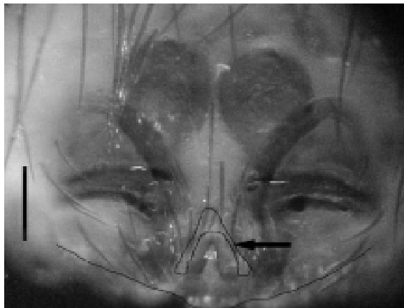
Fig. 3.— Epigynum of female holotype of Cicurina troglobia , new species, from Seven Mile Mountain Cave: Ventral view. Arrow indicates placement of atrium, scale = 0.1 mm.

Comments. —The posteriorly arching spermathecal stalk of the paratype looks like that of C. coryelli . It is uncertain if this is natural or possibly a result of extracting the genitalia from a living animal and then placing it in alcohol (all other genitalia were fixed in situ ). Because the lobe with primary pores was present and also rotated